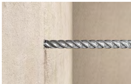
Drilling in concrete wall