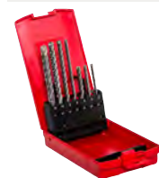
Quattric II S Set