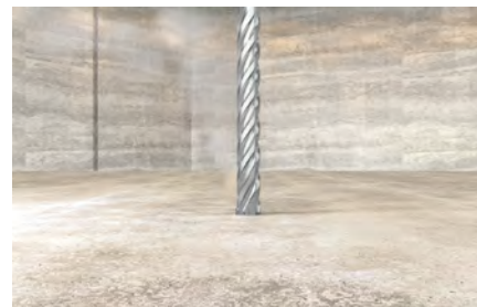
Drilling in floor plate