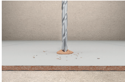
Drilling the material combination tile and concrete