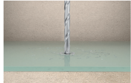
Drilling in glas